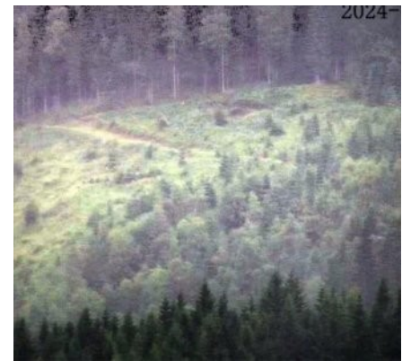
original picture, fog enhanced picture with 33x zoom from 2,5 km