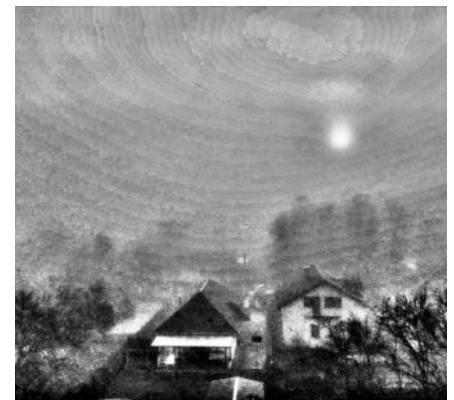
original image with DJI drone camera enhanced image altitude 20m, complete fog.